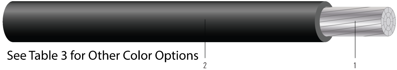
Image not to scale. See Table 1 for dimensions.

Power Cable 600 or 1000 Volts. Alumaflex® Brand Aluminum Alloy (AA-8176) Conductor. Cross-linked Polyethylene (XLPE) Insulation. Moisture Resistant High Heat.