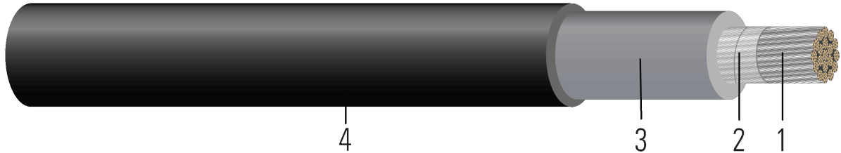
Image not to scale. See Table 1 for dimensions.

UL Listed as 2kV Heavy Duty Flexible Power Cable (HDFPC) DLO, Rated 90°C Dry or Wet. 2kV Type RHH/RHW-2 Flexible Power Cable Rated for Dry or Wet. CSA Listed as 2kV Type RW90. Composite Thermoset Wall EPDM Insulation Thermoset CPE Jacket. Silicone-Free. MSHA Approved