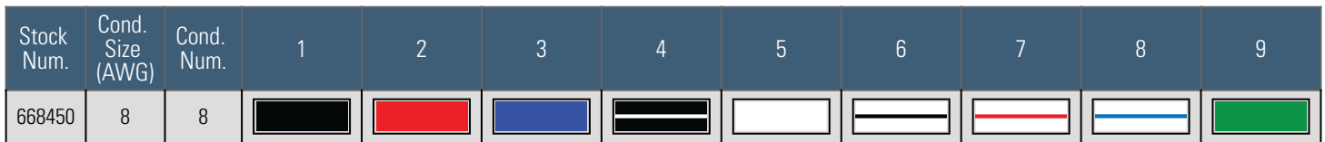
Table 3: Neutral Per Phase Colors