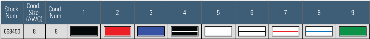
Table 3: Neutral Per Phase Colors